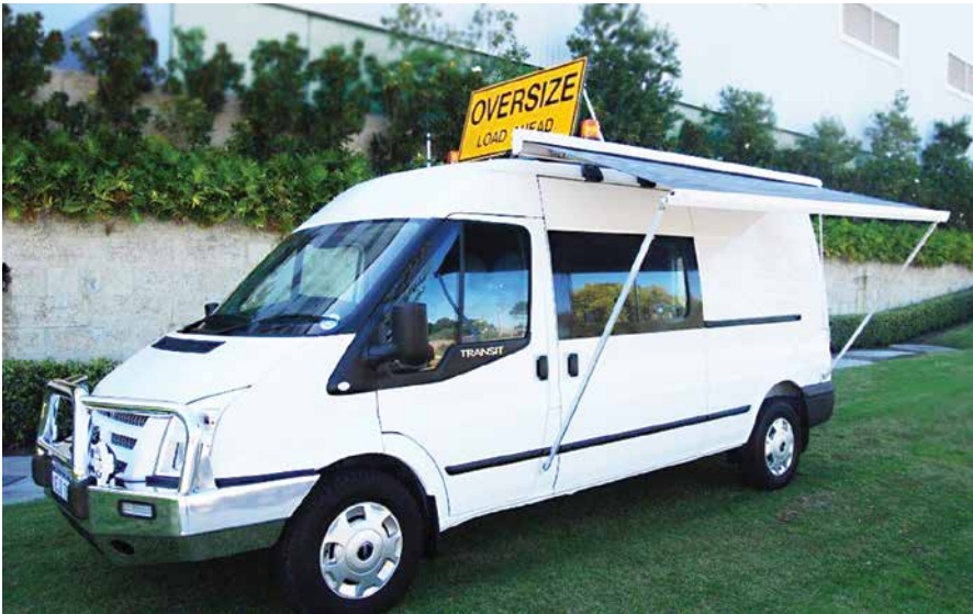
Pilot Vehicles hazard signage